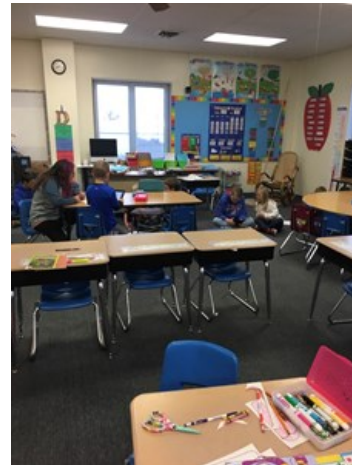
The first graders performed plays in their reading groups! The rest of the students practiced being a good audience.