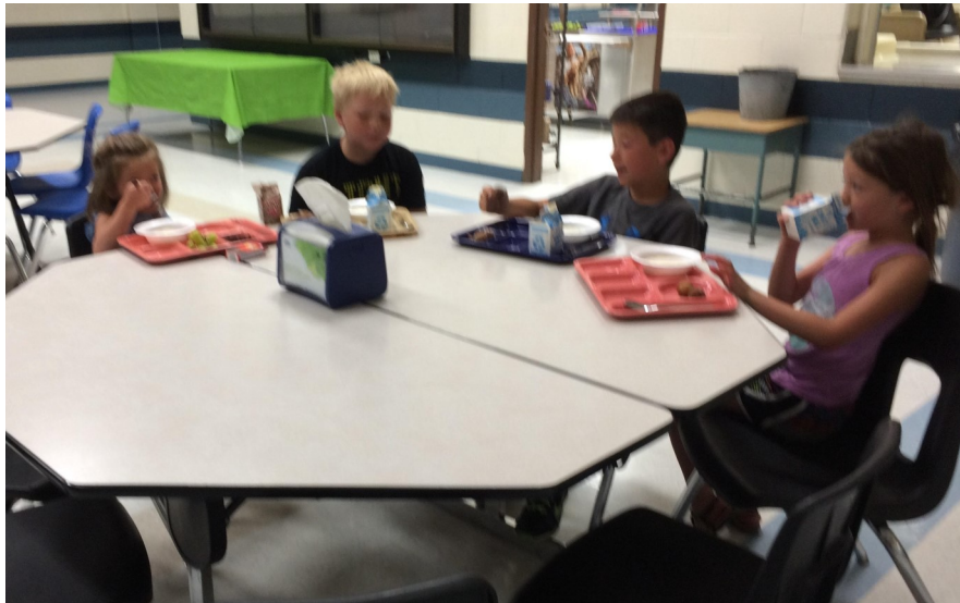
Summer Food Program