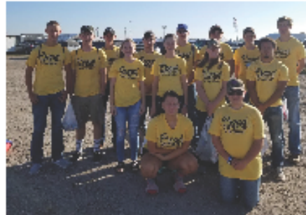
HS FFA Members at Husker Harvest Days

Earlier this year we had the honor of listening to Dr. Temple Grandin present on Animals & Autism.