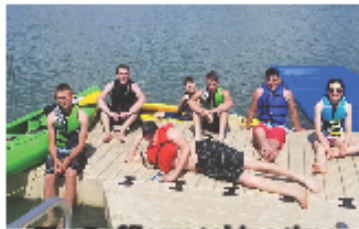
The 7 officers taking time from swimming to pose for a picture

We continued our planning during our officer retreat to