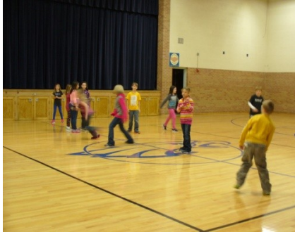
The students played Stealing Sticks, a trail game similar to Capture the Cones.